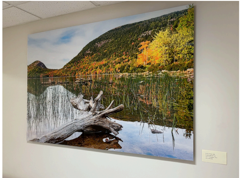
Nature imagery in the Emergency Department promotes relaxation and calm for patients and staff.

In mental health facilities, art therapy is particularly effective. It helps patients externalize emotions, reduces feelings of anxiety, depression, and stigma, and improves self-esteem.