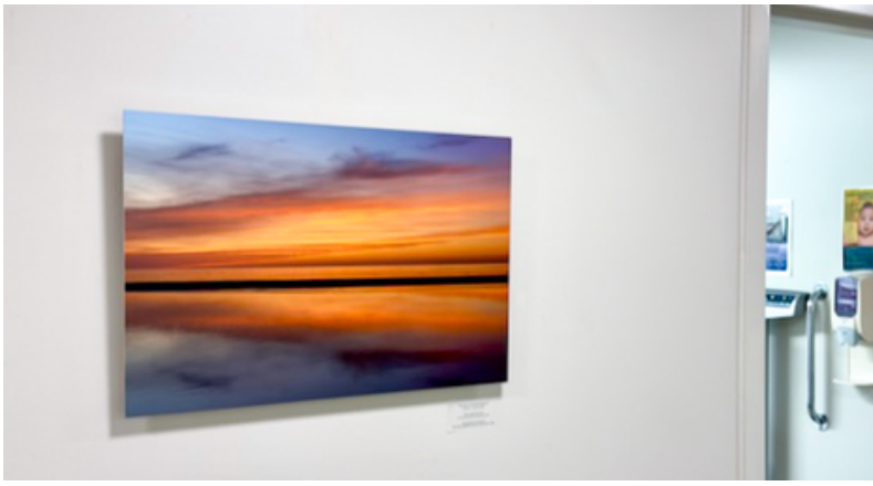
Local, coastal imagery displayed in clinic hallways offers a moment of calm