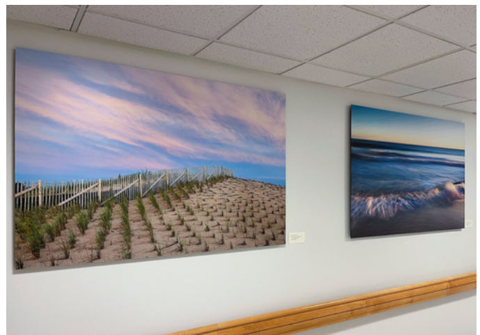
Soothing landscapes displayed in the Emergency Department Waiting Area (left) and Entrance (above) provide respite in times of stress and uncertainty.